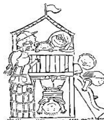
Ascension Lutheran Preschool